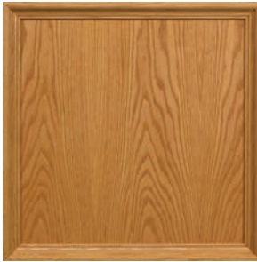
Species: Oak #1-82 Finish: Natural