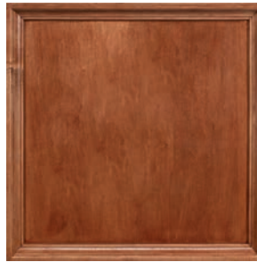
Species: Maple #2-83 Finish: Cider