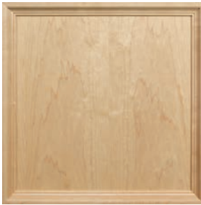
Species: Maple #2-82 Finish: Natural