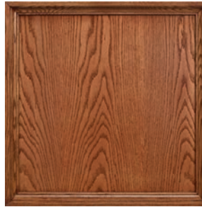
Species: Oak #1-83 Finish: Cider