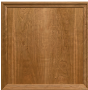
Species: Cherry #3-82 Finish: Natural

Unfinished #80 and Paintable #81 also available