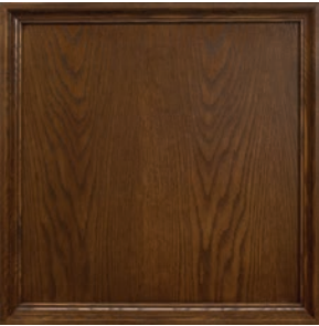
Species: Oak #1-85 Finish: Mocha