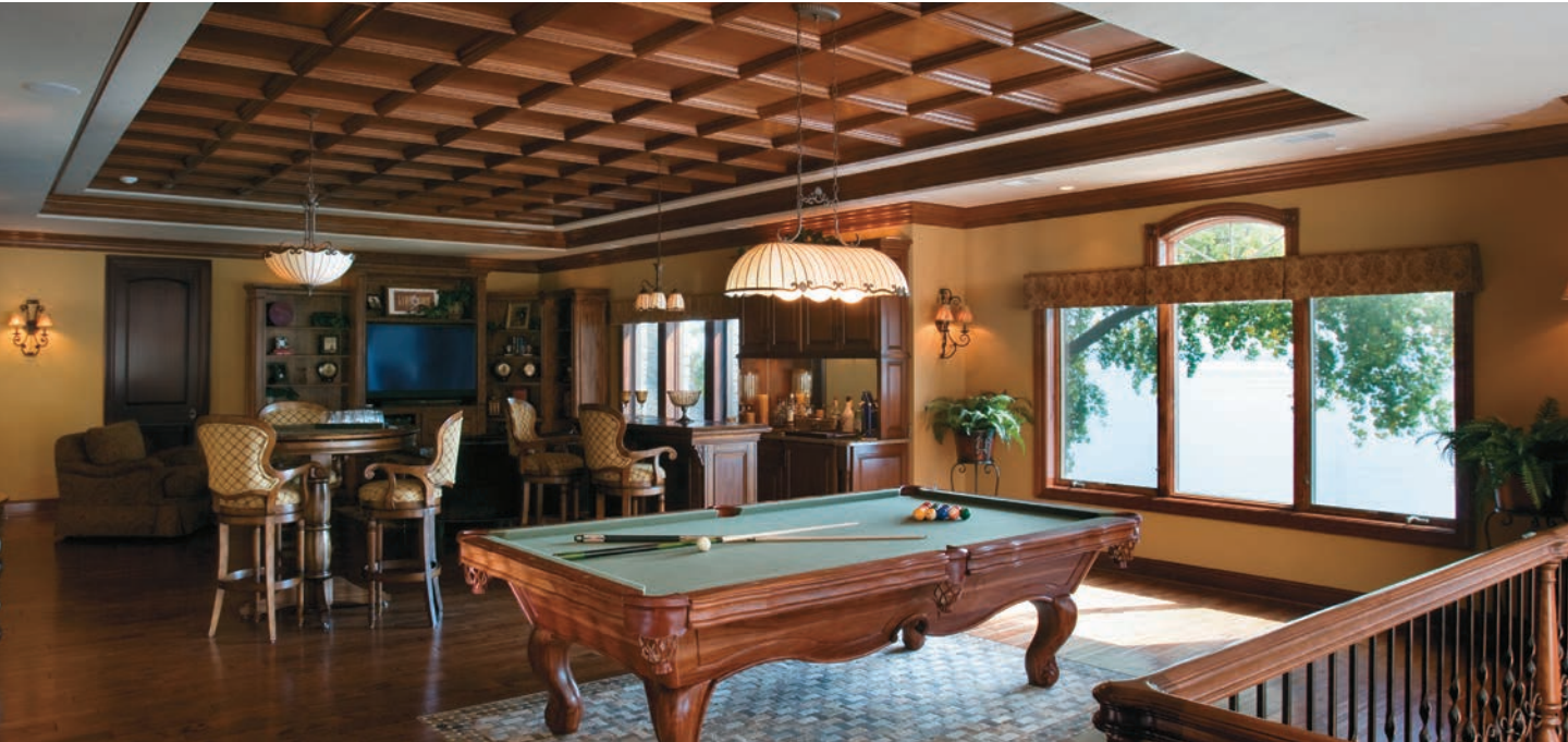
Cherry species in Cider finish

Evoba Wood Ceiling System combines the architectural detailing of custom-crafted millwork with the easy installation of conventional suspension systems. Prefabricated mains and cross-tee grid components connect using patented joint technology to form a strong, perfectly milled joint without custom tooling.