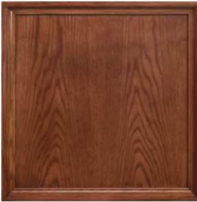
Species: Oak #1-84 Finish: Bordeaux