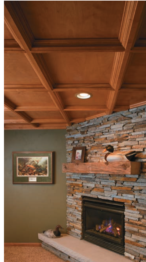
Maple species in Cider finish