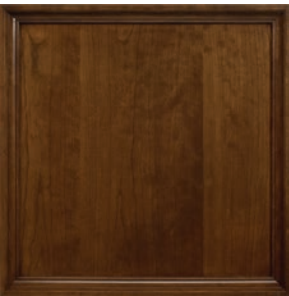
Species: Cherry #3-85 Finish: Mocha