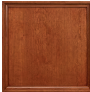
Species: Cherry #3-83 Finish: Cider