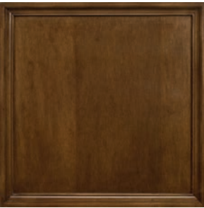
Species: Maple #2-85 Finish: Mocha