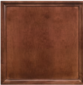
Species: Maple #2-84 Finish: Bordeaux