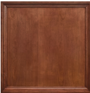
Species: Cherry #3-84 Finish: Bordeaux